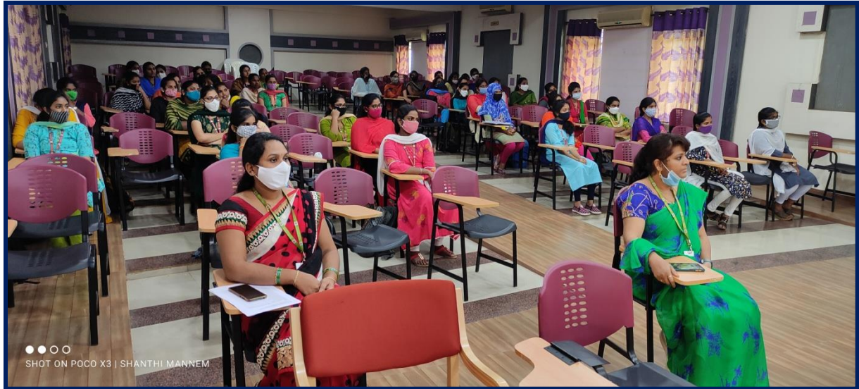
Staff along with students listening very eagerly